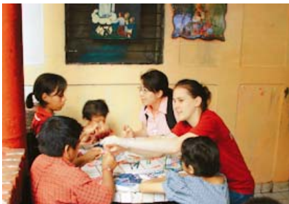
Sponsor a Teen Missionary to El Salvador. See article at right.

Don't let the crowd pressure you; stand for something or you'll fall for anything.